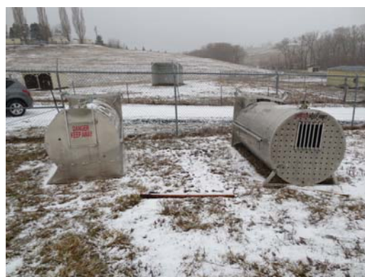
Fig 10. Bear Traps at Bear Research Center