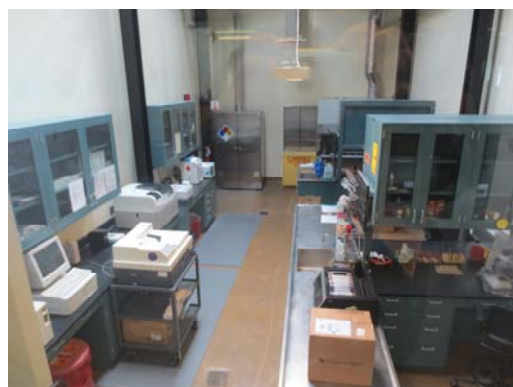
Fig 2. Lab at Marine Mammal Center