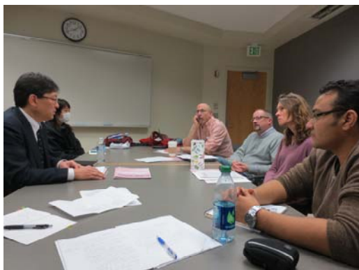
Fig 7. Meeting with the bear researchers from WSU