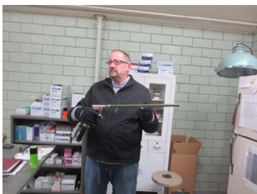
Fig 9. Demonstration of bear tranquilization Techniques at Bear Research Center