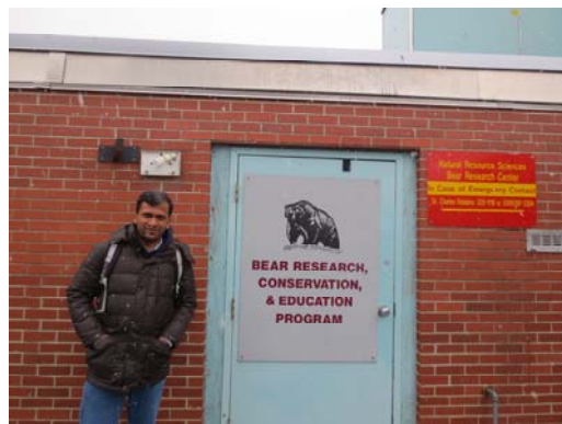
Fig 8. Visit to Bear Research, Conservation and Education Program, WSU