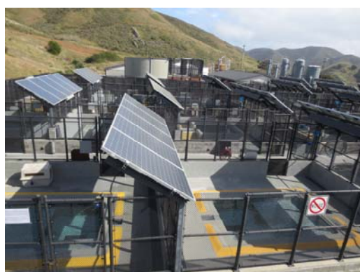
Fig 3. Area for keeping sick mammals at Marine Mammal Center