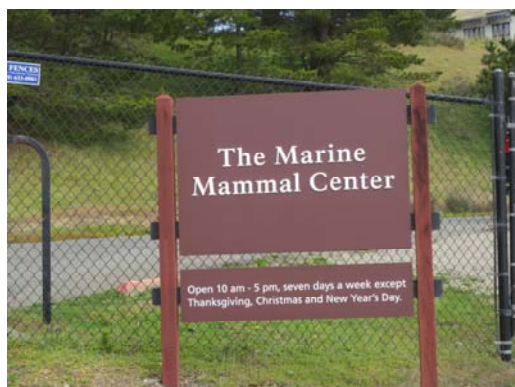
Fig 1. Marine Mammal Center