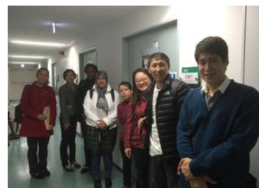
All internship students with OIE staff

I collected some good experiences which would be able to implement in our country, for instance, good collaboration between human and animal health organizations can minimize the health, social and economic impact from diseases arising at the human-animal interface. In addition, I got useful ideas and information about how to organize the international meeting including planning and organization.