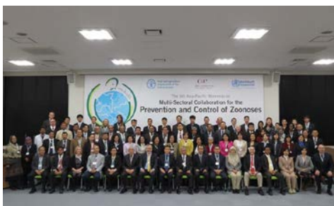
All participants of workshop in Sapporo