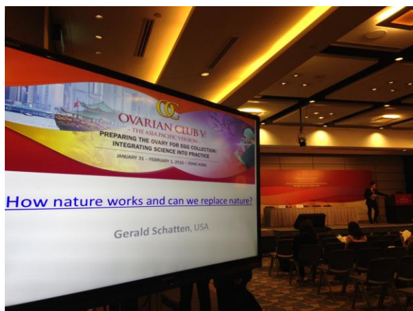
A lecture will soon begin