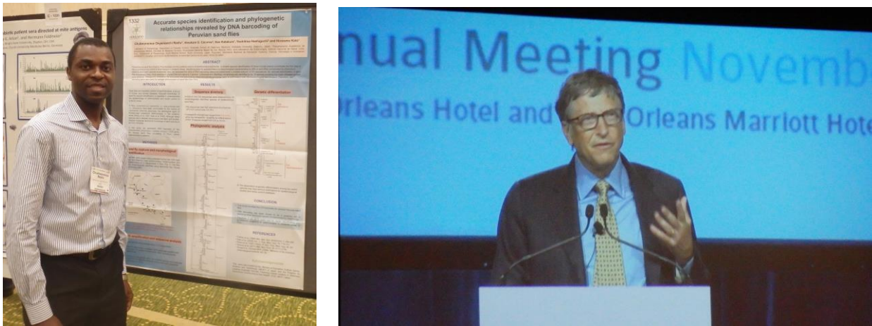
Presentation at ASTMH