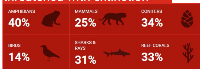
IUCN Red List

More than 26,500 species are threatened with extinction